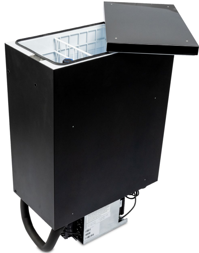
NEW BI 36