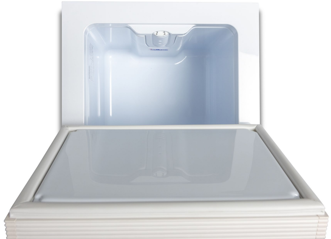
High Quality Thermoformed Inner Cabinet