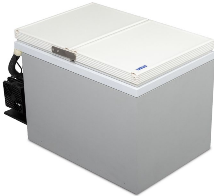
BI 29 DUAL

Following our latest product information concerning our Built-In Mini Series, we are pleased to highlight main features and differences within the superseded parts