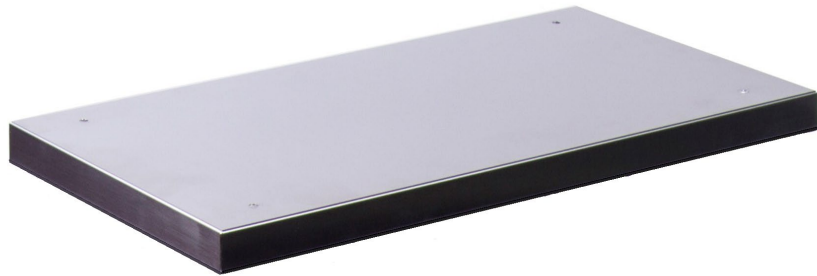
OLD STAINLESS STEEL DOOR PANEL