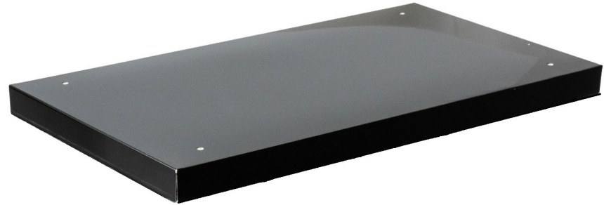
NEW BLACK DOOR PANEL