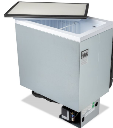
BI 41 DUAL