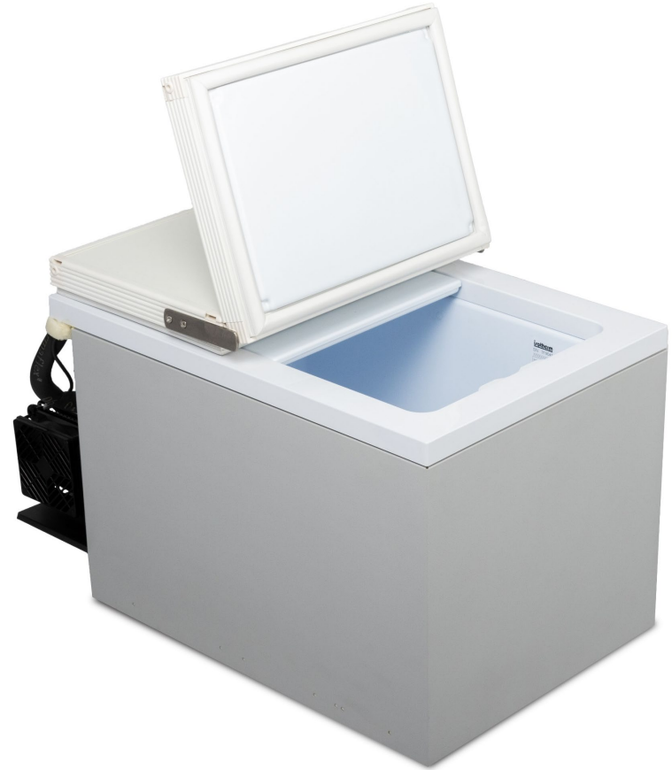
NEW BI 29 DUAL