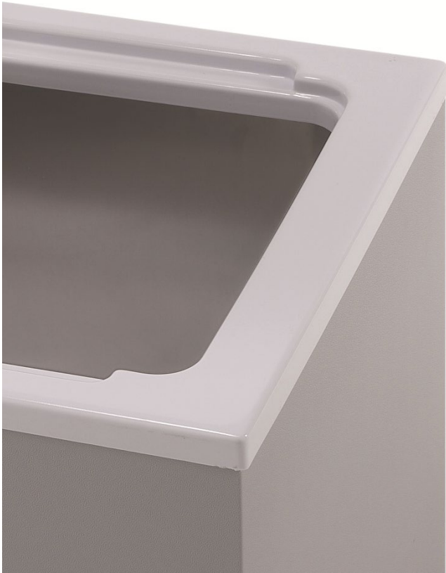
Stainless Steel Inner Lining