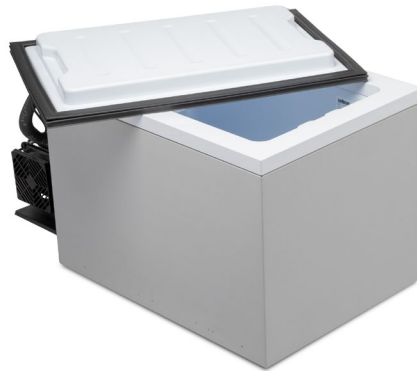
BI 29 DUAL CUSTOM