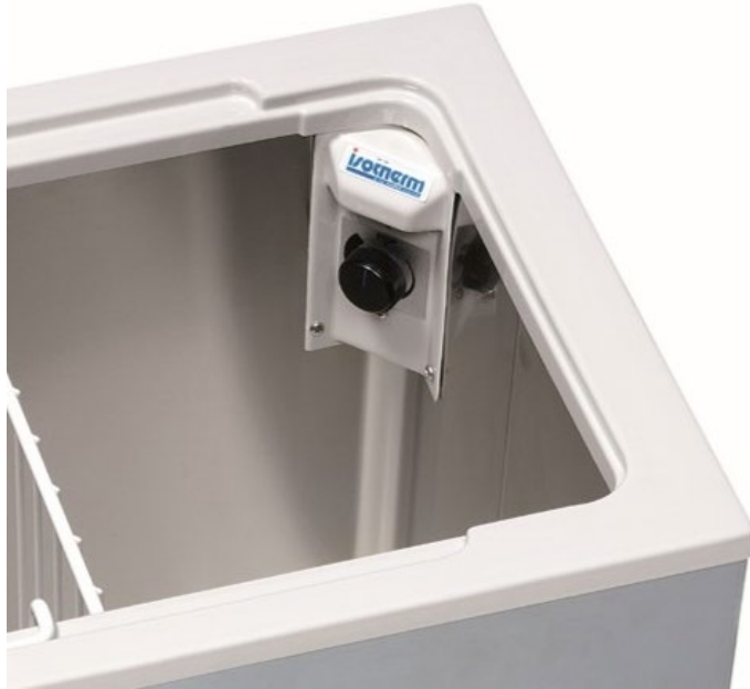
Stainless Steel Inner Lining