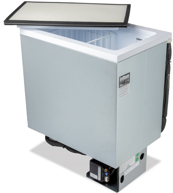
NEW BI 41 DUAL