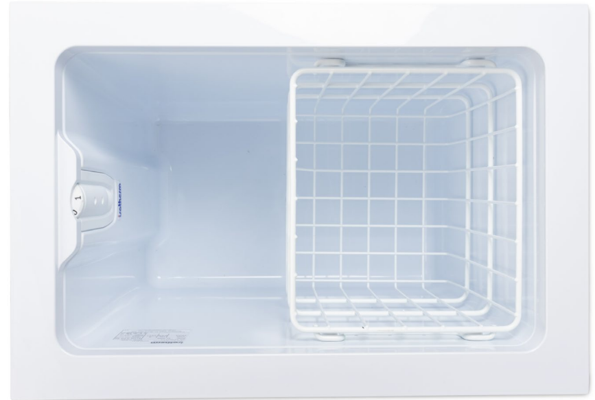
High Quality Thermoformed Inner Cabinet